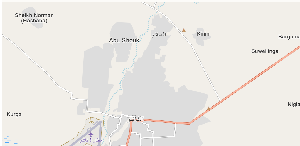
*The figures cannot be directly verify. Care should be taken whenever they are being used for any purpose. They are estimates and the estimates vary between interlocutors

The Abu Shouk IDP Camp, located in Al Fasher, North Darfur, houses around 190,000 individuals across 38,000 households*. Established during the 2003-2004 Darfur conflict, the camp's residents primarily originate from various conflict-affected areas. This Cluster's site assessment tool identifies population demographics and multi-sectoral gaps.