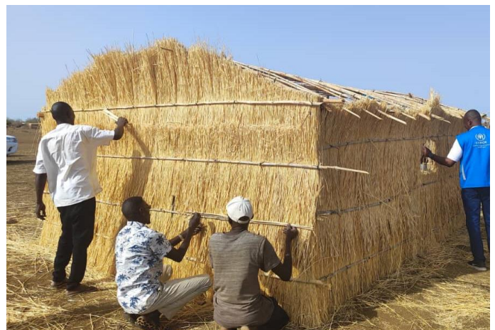
Community representative with support of partner agencies build their shelter in the newly designated site of Abu-Naja, Gedaref

In the Northern State, UNHCR conducted an orientation session for the Sudanese Red Crescent (SRC) staff (8) on the use of site assessment tools and the roll-out of the same in the areas of coverage.